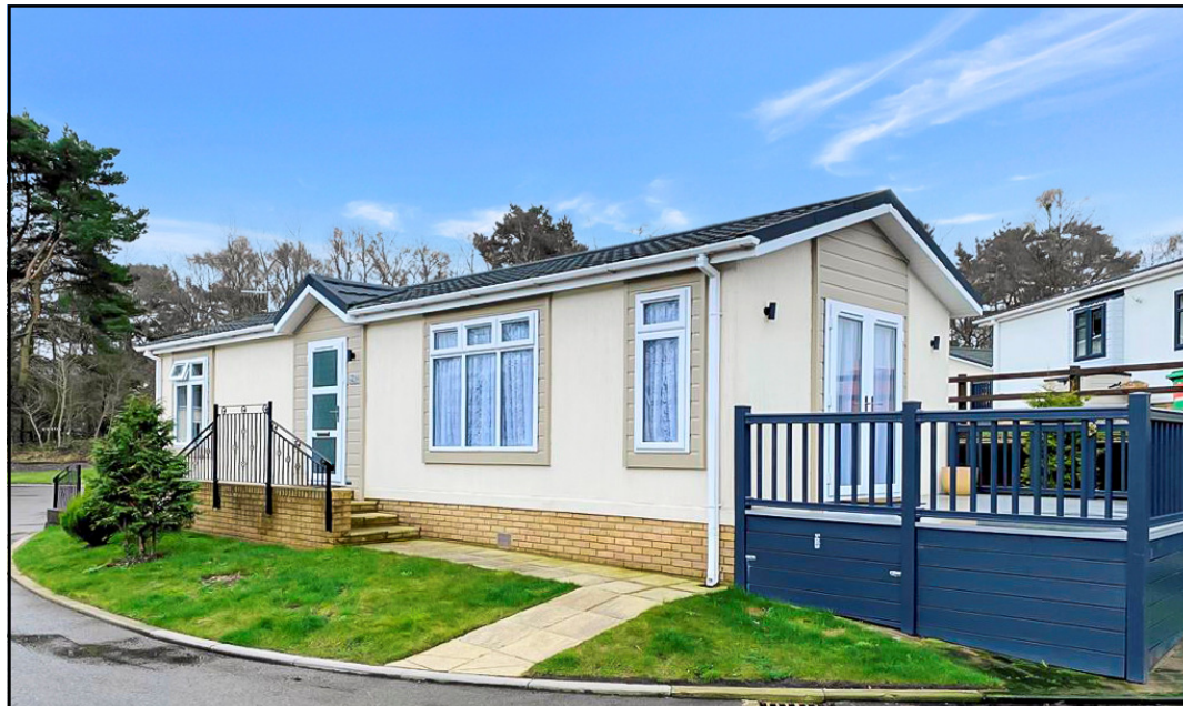
Stylish Modern Home with Large Raised Deck

2 Laburnum Drive, New Forest Glades, Matchams Lane, Christchurch. BH23 6DQ